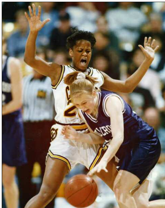
Colorado drew 11,072 fans for its first and second round sessions of the 1995 NCAA Tournament as the Buffs defeated Holy Cross and Southwest Missouri State.