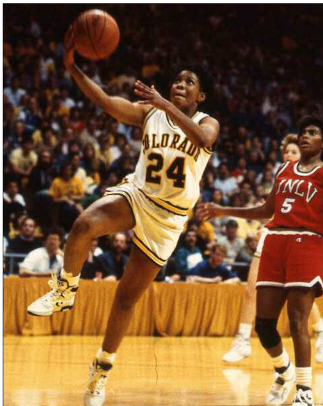
Colorado's first NCAA Tournament home game brought a school-record sold out crowd of 11,199 against UNLV on Mar. 18, 1989.